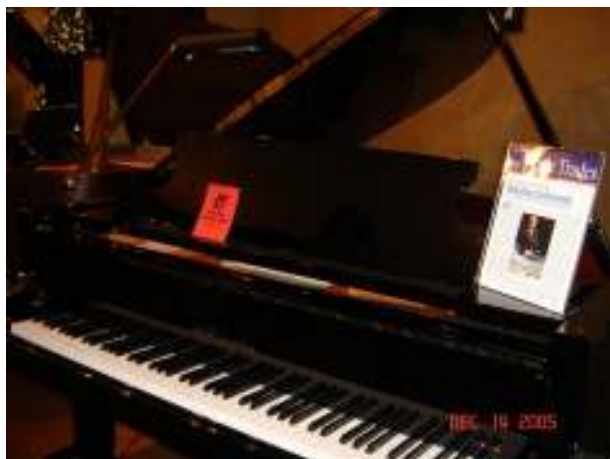
The new Schimmels are a dream to play...