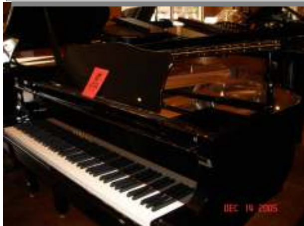
Used Yamaha C-3 6'1, 1995 $14,500