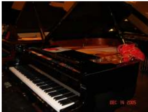
5'7 $27,000 / 6'3 $31,000 / 7'0 $34,000