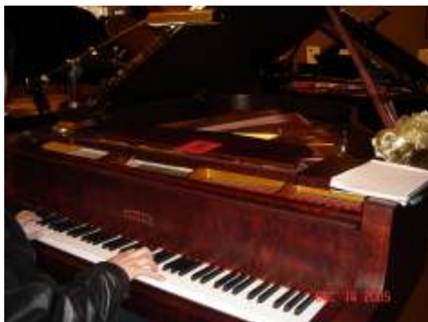
A New Estonia wood finish $28,000