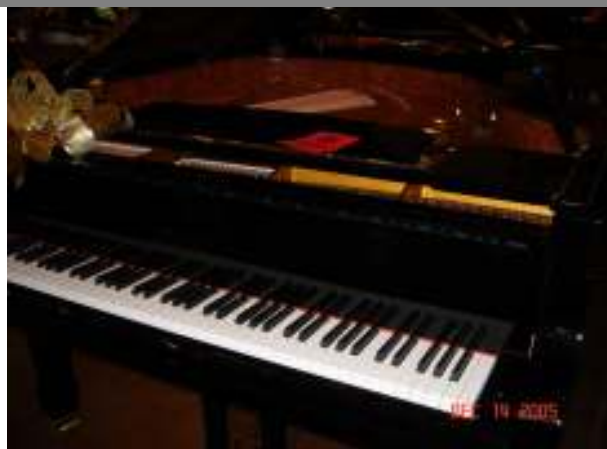
New Estonia's 5'6 $19,500 // 6'3 $24,780